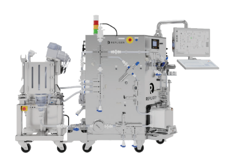
KrosFlo® RS 30